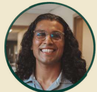
RAFAEL ALAMILLA, PH.D. HEALTH SCIENTIST INDIANA UNIVERSITY

Physical activity (PA) is essential for preventing chronic illnesses and promoting lifelong health, yet many adults fail to meet established PA guidelines. This is particularly true for underrepresented racial/ethnic minority adults, who face inequities that limit participation. This presentation will present the final outcomes of a mixed methods study done in Marion county that aimed to contextualize the factors promoting and preventing physical activity among minority adults. Attendees will 1) analyze factors influencing PA among minorities with varying leisure-time PA levels to identify barriers and facilitators; and 2) develop strategies to increase PA participation in minorities while addressing health disparities.