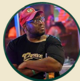
WILDSTYLE PASCHALL VISUAL ARTIST & ACTIVIST