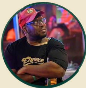
WILDSTYLE PASCHALL VISUAL ARTIST & ACTIVIST